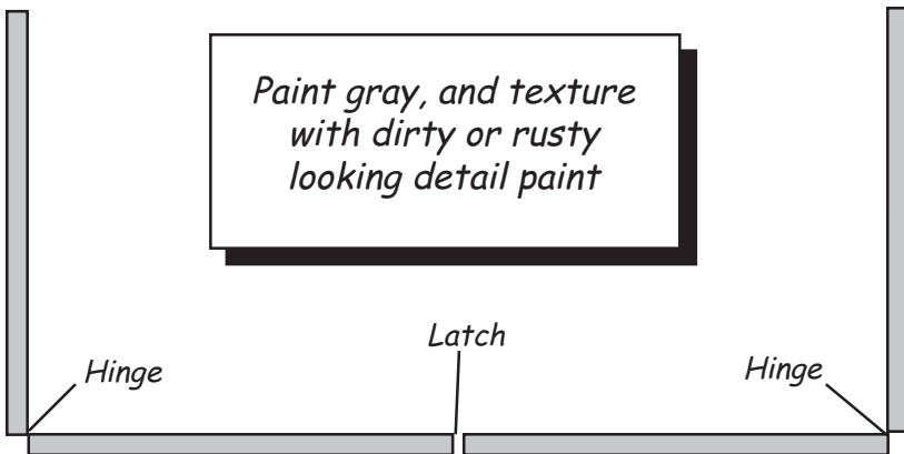
Fig. 3 - Upper view of completed "Set Up To Fail" jail cell